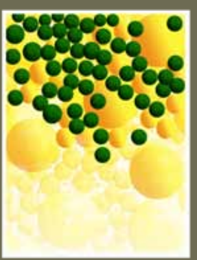
Integrates into the substrate soil.